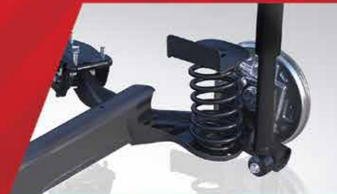
Long travel suspension