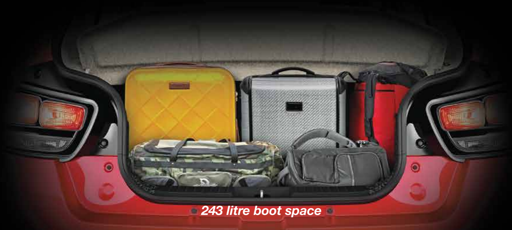
243 litre boot space