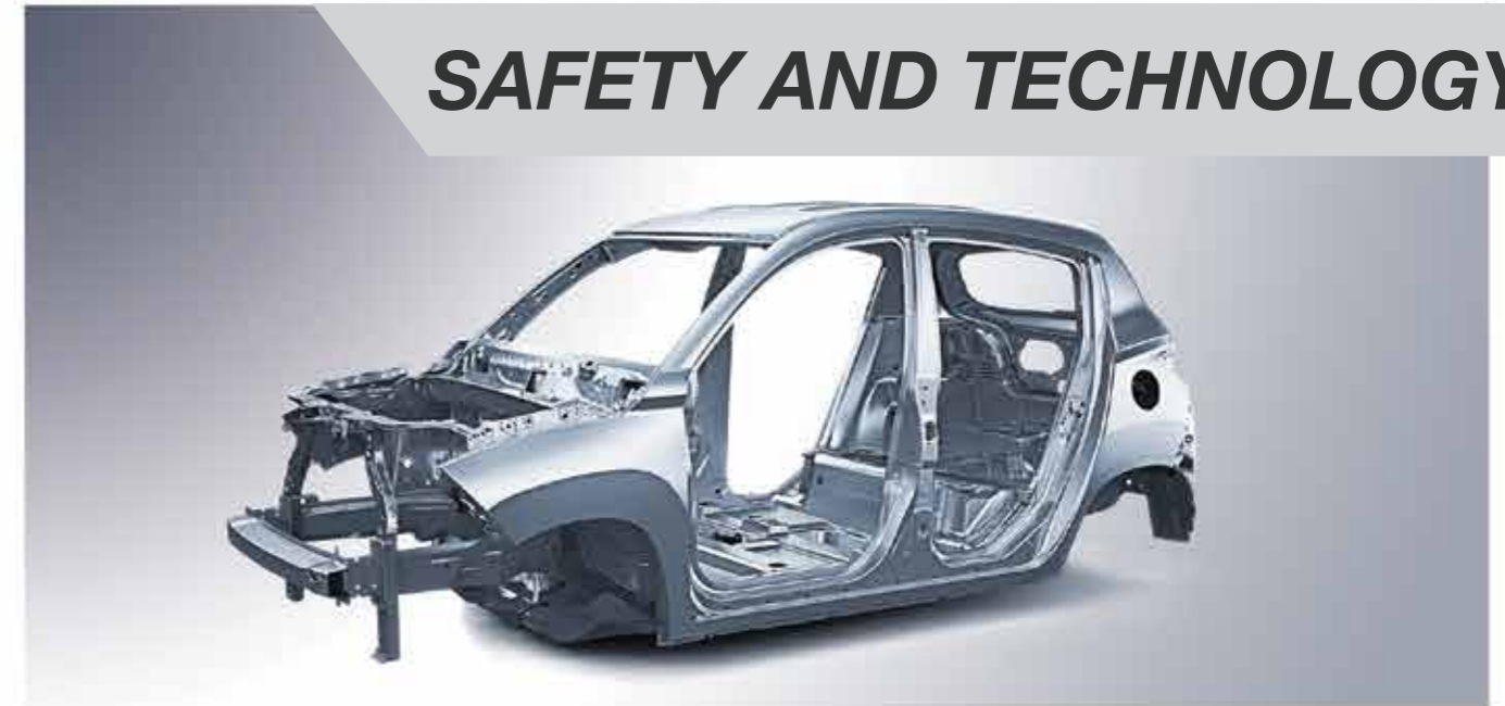
ROBUST MONOCOQUE CONSTRUCTION FOR SUPERIOR RIDE & HANDLING