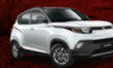
White & Black