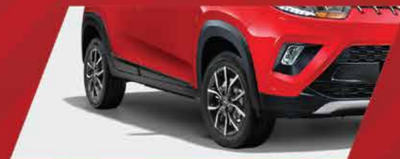
High angles of approach & departure