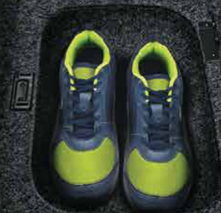
Under floor storage