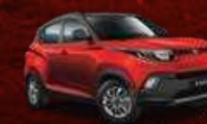
Red & Black