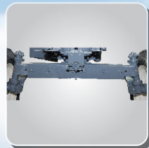
ADJUSTABLE FRONT AXLE